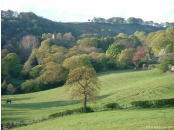
Looking along the valley to the church tower