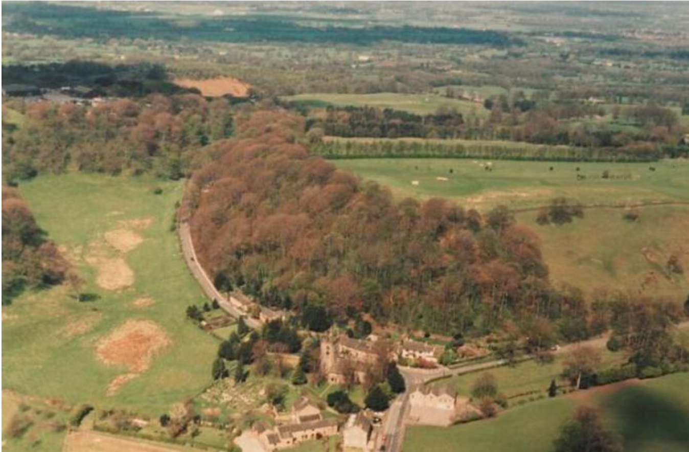
Aerial view of Pott Shrigley village centre around the church

Looking at the most recent census could give the impression that the population of Pott Shrigley is small (269). However, this small civic population should not be confused with the size and energy of the church congregation. The electoral roll currently stands at 289 and exceeds the population of the parish (a statistic that most parishes would struggle to match). On average, over 100 people attend the regular Sunday services, travelling from Bollington, Macclesfield, other neighbouring villages and further afield to do so.