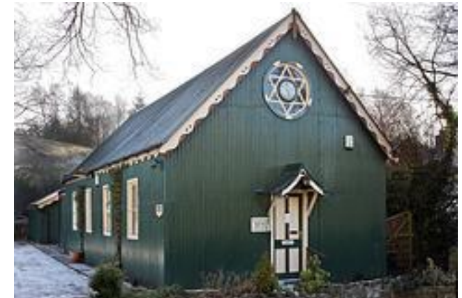
The Coffee Tavern

Looking at the most recent census could give the impression that the population of Pott Shrigley is small (269). However, this small civic population should not be confused with the size and energy of the church congregation. The electoral roll currently stands at 289 and exceeds the population of the parish (a statistic that most parishes would struggle to match). On average, over 100 people attend the regular Sunday services, travelling from Bollington, Macclesfield, other neighbouring villages and further afield to do so.